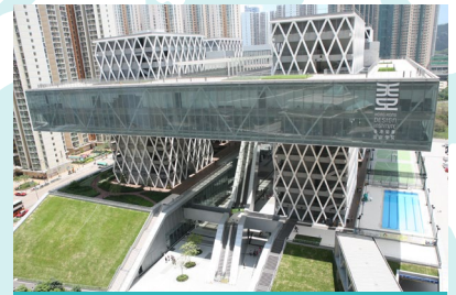
Hong Kong Design Institute (HKDI)