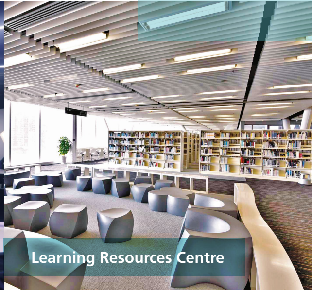
Learning Resources Centre