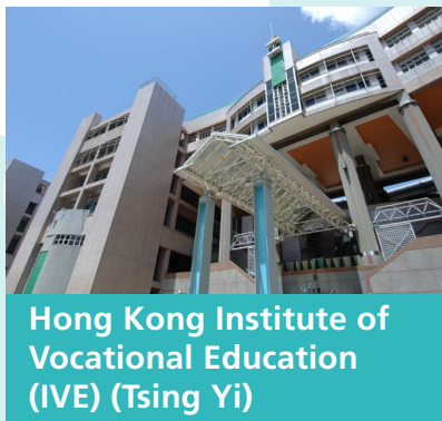
Hong Kong Institute of Vocational Education (IVE) (Tsing Yi)

Over 40 campuses and training centres in Hong Kong